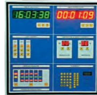
Surgeon Control Panel