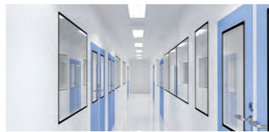
Vision Panel & Modular Doors