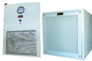
Positive Pressure System